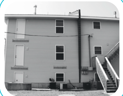
Building in June after reconstruction work.