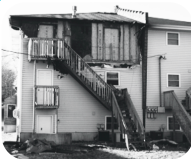
Raytown apartment building after February fire

We are glad for the dedicated firefighters at the Raytown Fire Department who put their own safety in jeopardy to extinguish dangerous fires like ours.