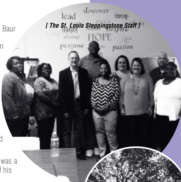
[ The St. Louis Steppingstone Staff ]

And finally, O God of compassion, bless this house, but also each of your children who walk through these doors that your kingdom might come in this time and place. We pray this in the name of Jesus. Amen.